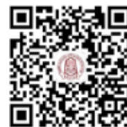
Study in BUCT