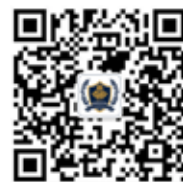
School of International Education